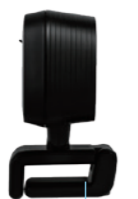
Tripod screw hole